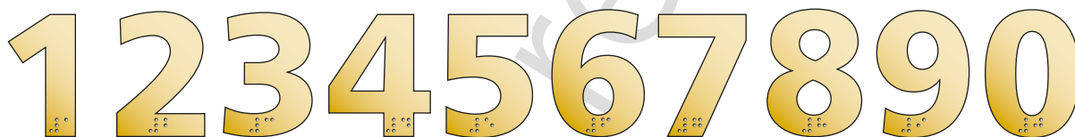
LIT 50 LT 1, 2, 3, 4, 5, ...